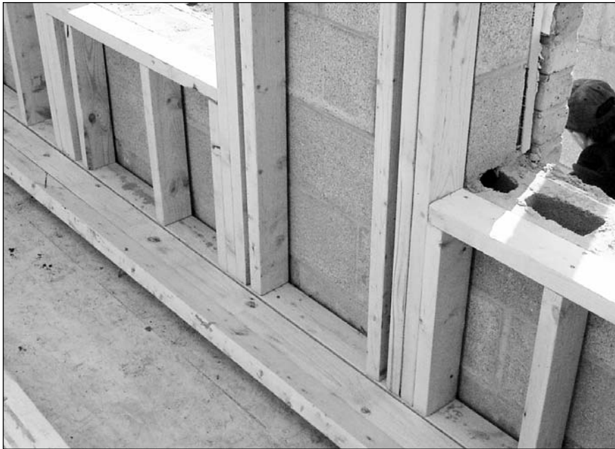
The rigid foam insulation between brick and block in this addition at 6423, combined with R-13 batts in the wood-framed interior walls, results in an R-18 wall.