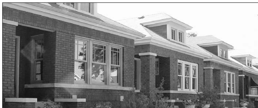
More than 80,000 bungalows were built in Chicago neighborhoods between 1900 and 1940. These middle-class homes served the expansion of Chicago beyond its industrial and commercial core.

This home was rehabbed with accessibility in mind (see Table 1). A 500 ft 2 addition to the back of the home includes an 11.5 ft x 10 ft (gross) master bedroom. A laundry room, a wheelchair lift that provides access to the ground floor and basement, and a wide corridor leading to the new rear deck are part of the addition. The addition was built over a conditioned crawlspace. The total floor area in the renovated home is 1,400 ft 2 . The existing kitchen and bathroom were demolished and rebuilt to accommodate a wheelchair. The two existing bedrooms, living room, and dining room were refin-