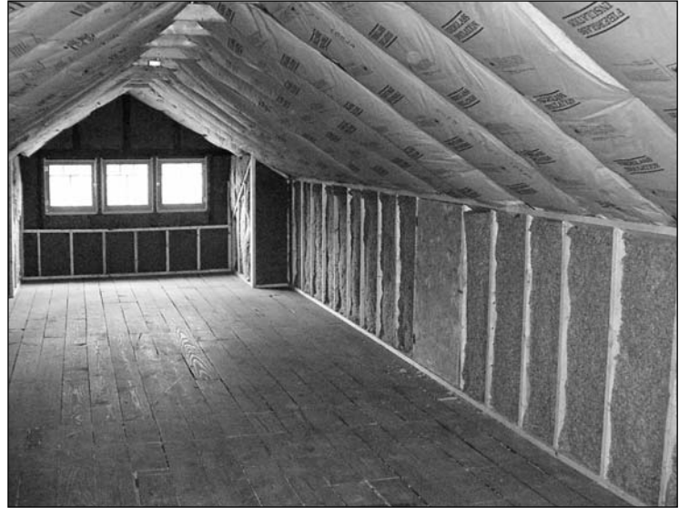
(left) The payback period for the four unique bungalow renovations ranged from approximately 5 years to just over 12 years. (above) The as-yet unheated attic at 6448 was framed and insulated with denim insulation and can be finished as a living space in the future.