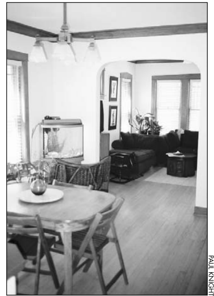
(left) The Arts and Crafts movement promoted homes as private and individualized retreats from the hectic pace of city life. Each bungalow has unique features. (right) With HERS scores in the 80s, the residents of the renovated Chicago bungalows should enjoy cost-effective and energy-efficient comfort for years to come.